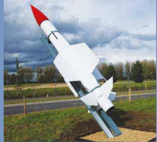
Westcott Venture Park