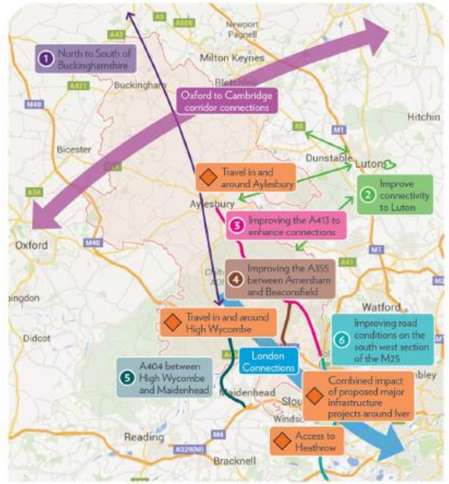
'9 These issues / solutions are all connected. They are divided up here simply to make the map easier to use

NIC review of the Oxford to Cambridge Arc. To fully realise this potential we would hope that the NIC recognises the potential of the area as a whole will have to be addressed. In particular, the largely rural area between the cities has both the desire and potential to enhance this sub-regional growth.